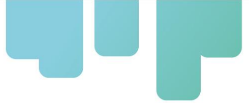
Repellent activity of essential oils from native plants and their blend for Tribolium castaneum control in store grains